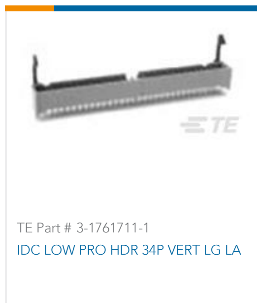
TE Part # 3-1761711-1 IDC LOW PRO HDR 34P VERT LG LA