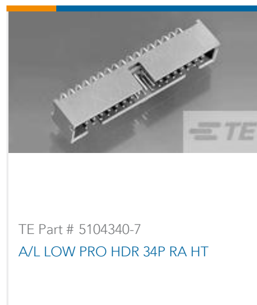
TE Part # 5104340-7 A/L LOW PRO HDR 34P RA HT