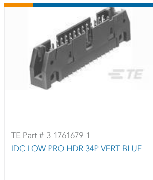
TE Part # 3-1761679-1 IDC LOW PRO HDR 34P VERT BLUE