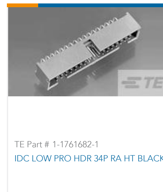
TE Part # 1-1761682-1 IDC LOW PRO HDR 34P RA HT BLACK